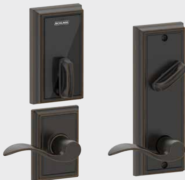
Schlage Control™ Smart Interconnect Lock with Addison trim in Aged Bronze with Accent lever