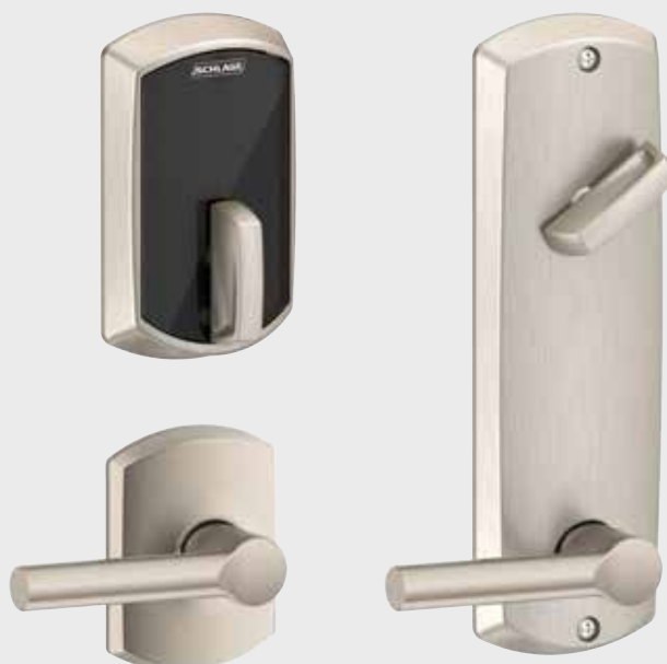
Schlage Control™ Smart Interconnect Lock with Greenwich trim in Satin Nickel with Broadway Lever